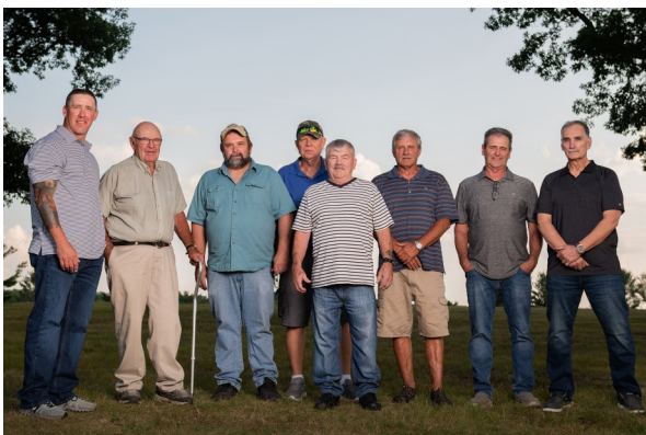
Pictured: 9 miners reunite 20 years after event at Quecreek.

As I read this story, I thought about how important it is to pull together as ministers and as churches. Ministry can be lonely at times. A pastor or staff minister can get discouraged during those frigid ministry moments. Paul reminds us, "Now we who are strong ought to bear the weaknesses of those without strength and not just please ourselves." (Romans 15:1, NASB 1995)